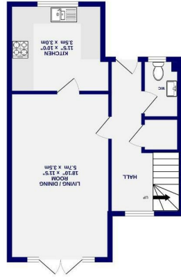
GROUND FLOOR 460 sq ft (42.7 sq m) approx.