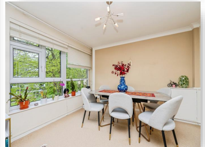
Ormsby Court Richmond Hill Road, Birmingham B15 3RJ