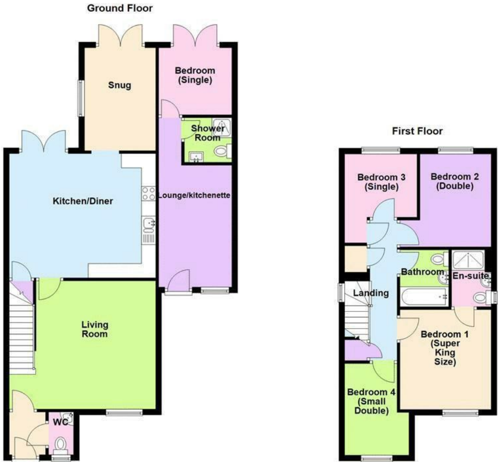
All measurements are approximate and are intended for general reference only. Floor plans may not be to scale. Viewers are advised to verify all measurements and dimensions independently. Plan produced using PlanUp.