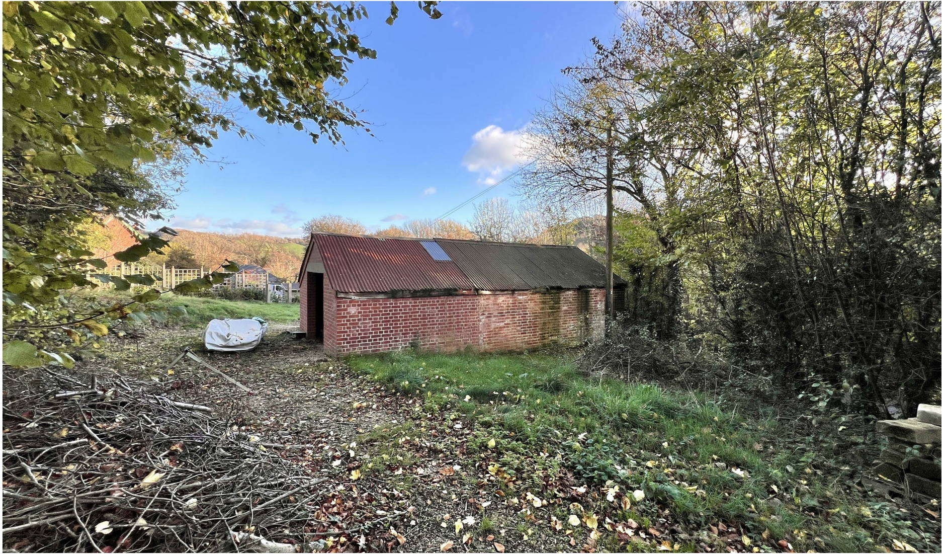
Barn & Land Nunnery Lane, Newport Auction Guide £150,000