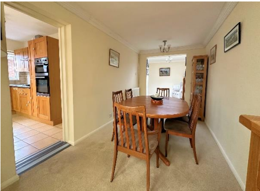
Kitchen:- 11' 9" x 7' 9" (3.58m x 2.36m)

A dual aspect room with UPVC double glazed windows to the side and rear elevations, the kitchen is fitted with a range of base, eye and larder style storage cupboards with roll top work surfaces, single bowl single drainer stainless steel sink unit inset with a mixer tap and part tiled walls, built in eye level oven and grill, gas hob with extractor canopy above, integrated dishwasher, space for fridge/freezer, tiled flooring, door to sitting room/bedroom three, flat ceiling. UPVC double glazed door to: