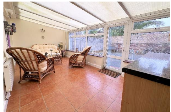
Sitting Room/Bedroom Three:- 11' 9" x 10' 9" (3.58m x 3.27m) Maximum Measurements

UPVC double glazed window to the side elevation, radiator, feature fireplace with gas wood burner inset, built in storage cupboard housing the gas central heating boiler, picture rail and coving to flat ceiling.