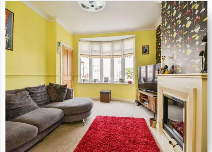
Belmont Avenue, Stockton-On-Tees TS19 0DX