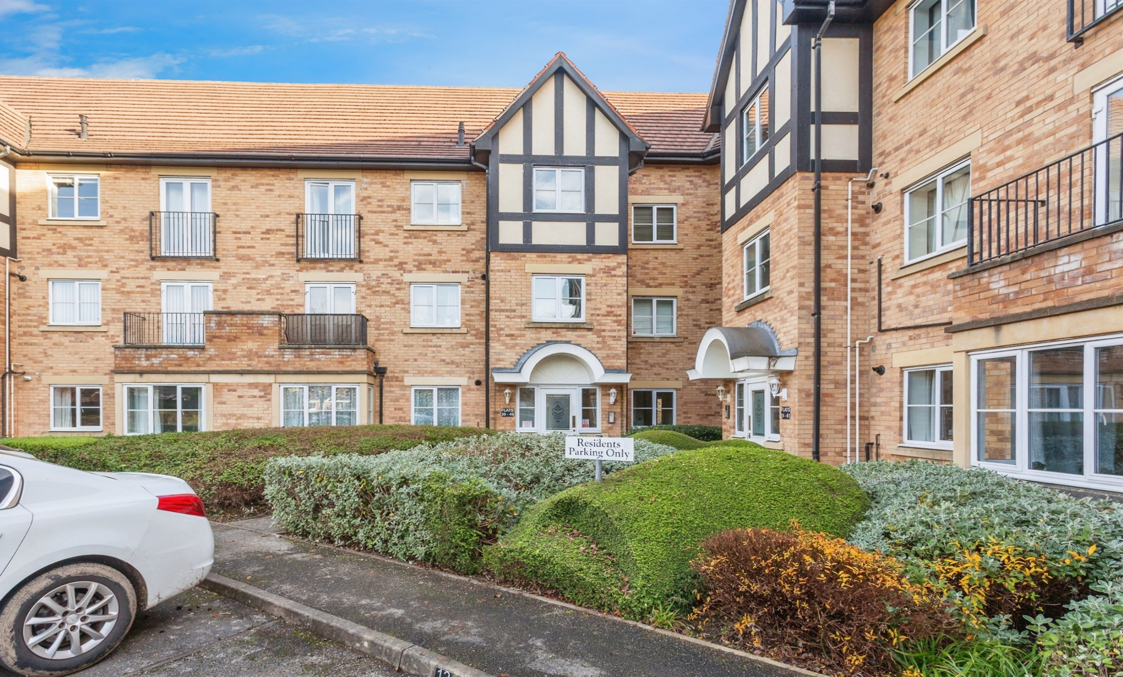
Princes Gate, Horbury Wakefield WF4 5RD