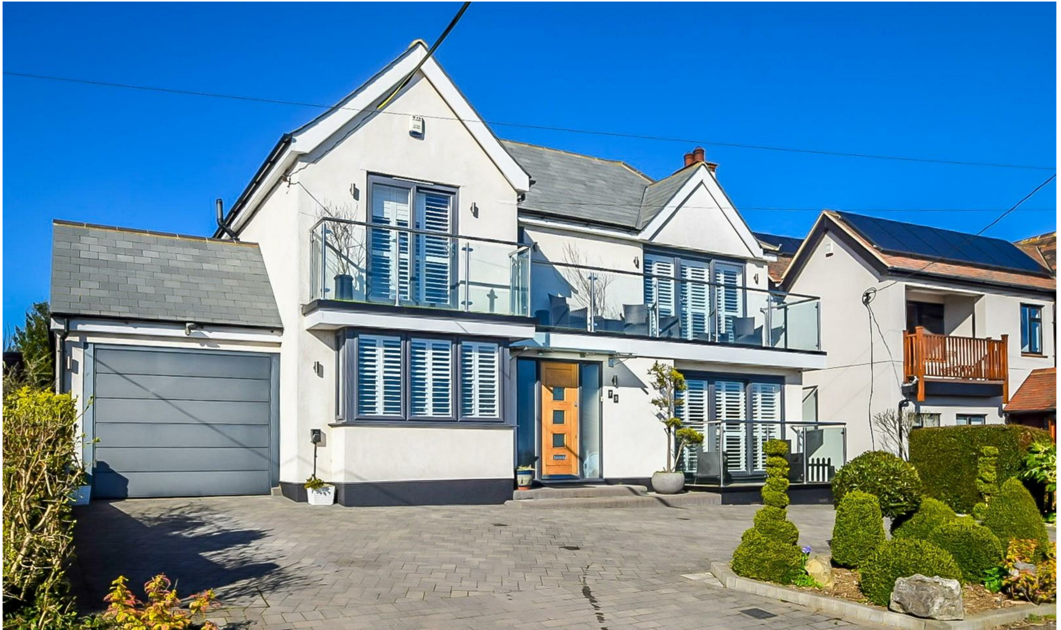
St. Marys Road, Benfleet £1,500,000