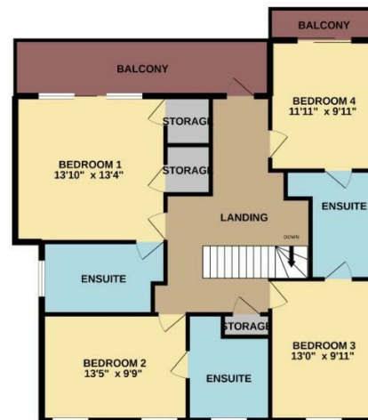
1ST FLOOR 1003 sq.ft. approx.