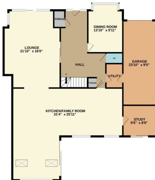
GROUND FLOOR 1637 sq.ft. approx.