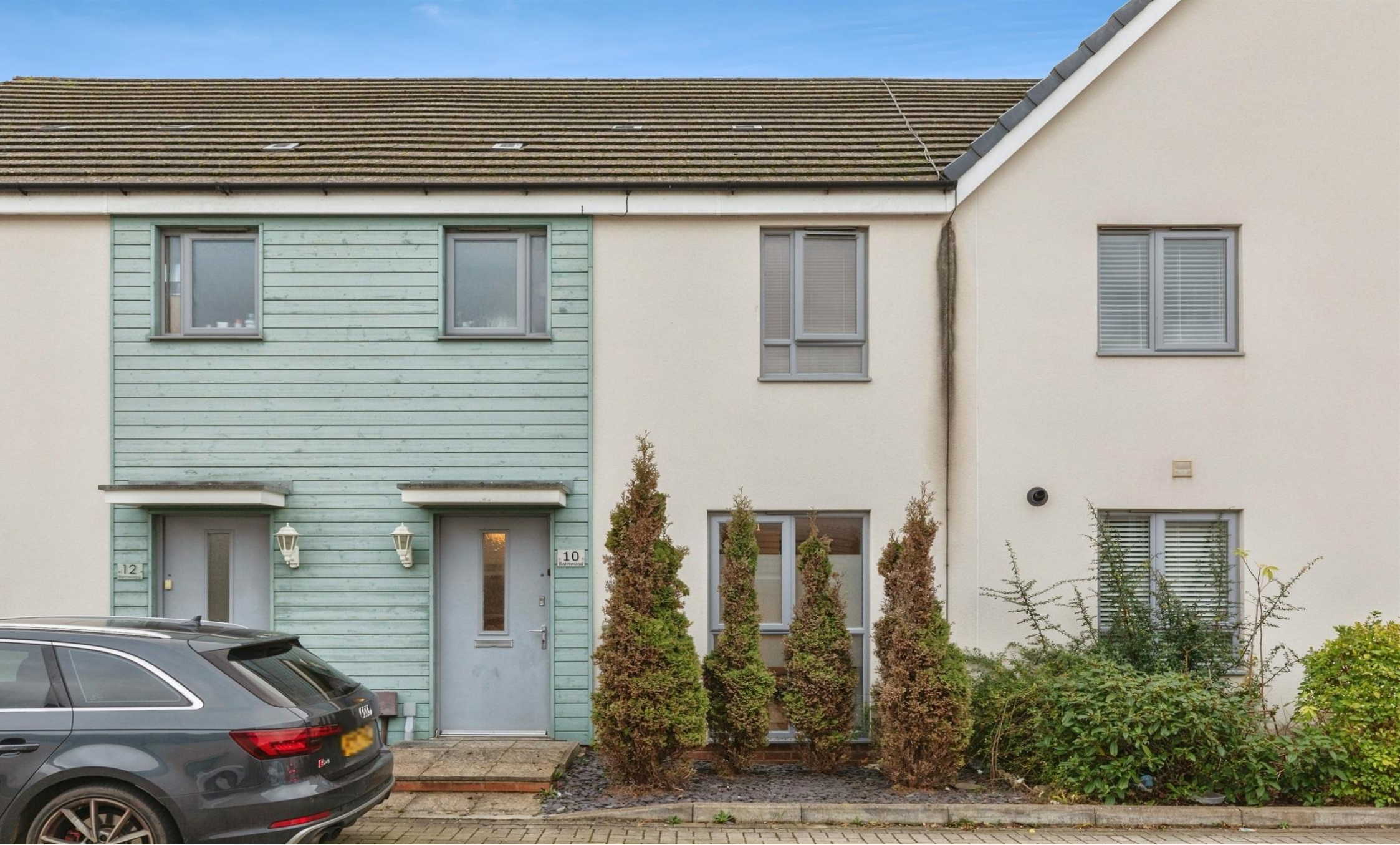
Barnwood, Bristol BS16 1GN