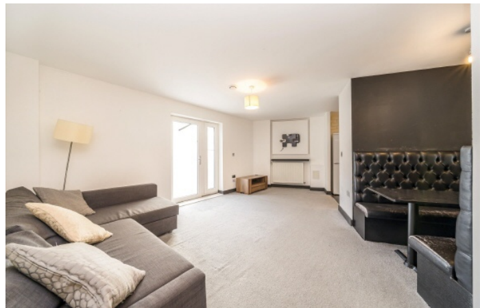
Fairthorn Road, SE7