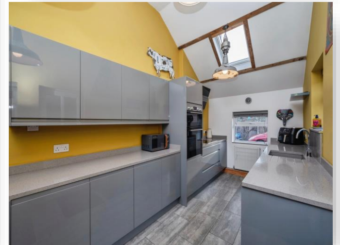
Meadow Lodge Walcott Road, Bacton Norwich NR12 0EY