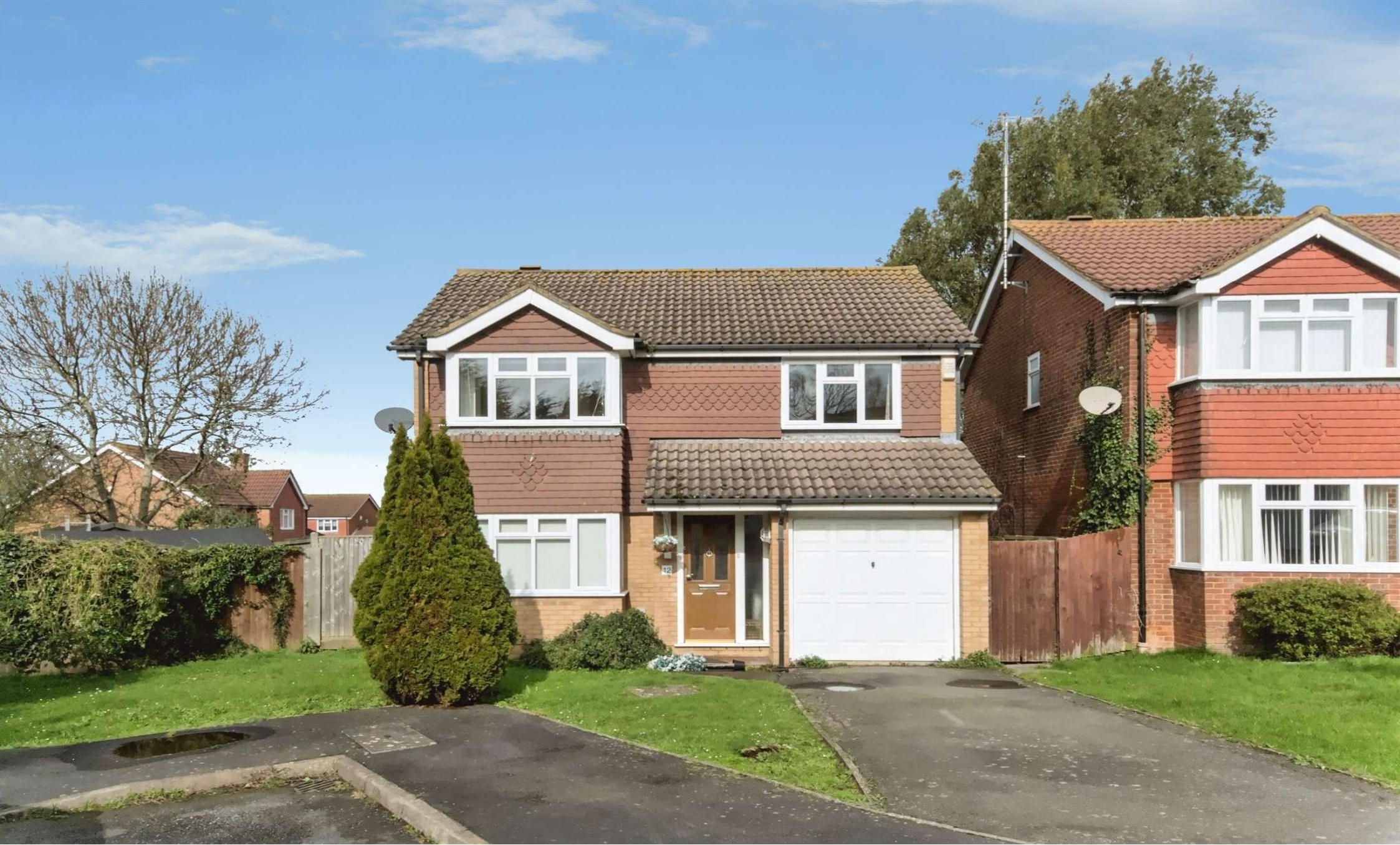
Langdale Close, Eastbourne BN23 8HS