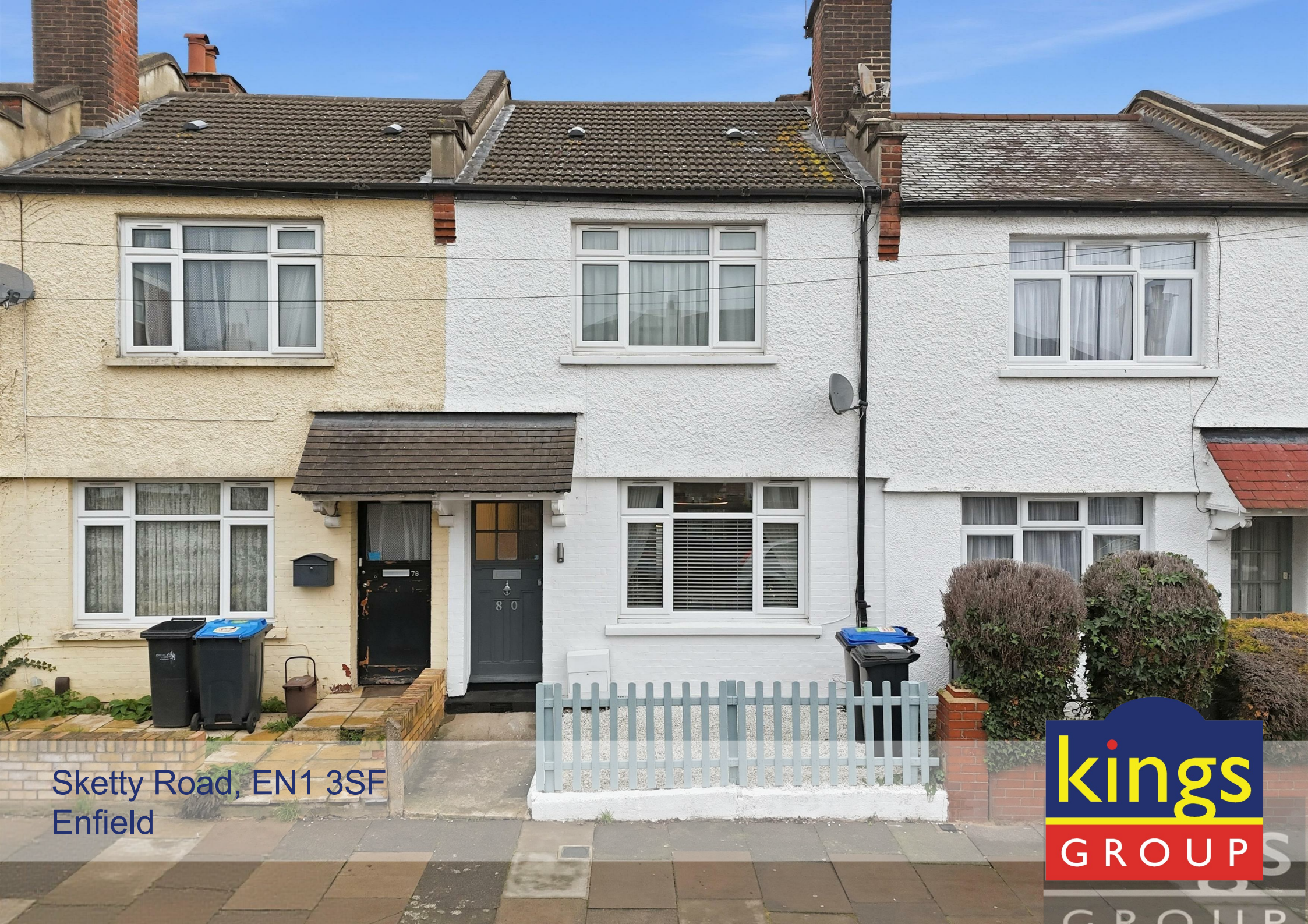
Sketty Road, EN1 3SF Enfield