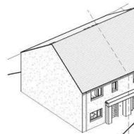
Scale 1:100 0 2m 4m 6m