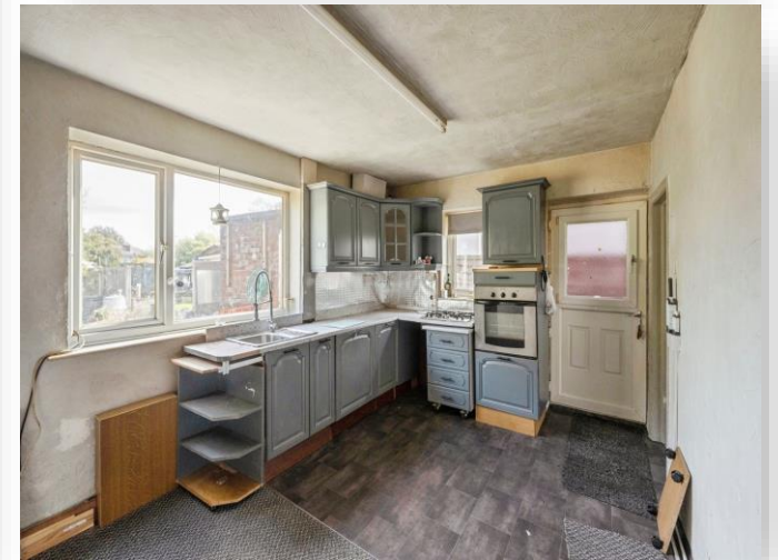
Knoll Beck Crescent, Brampton Barnsley S73 0TT