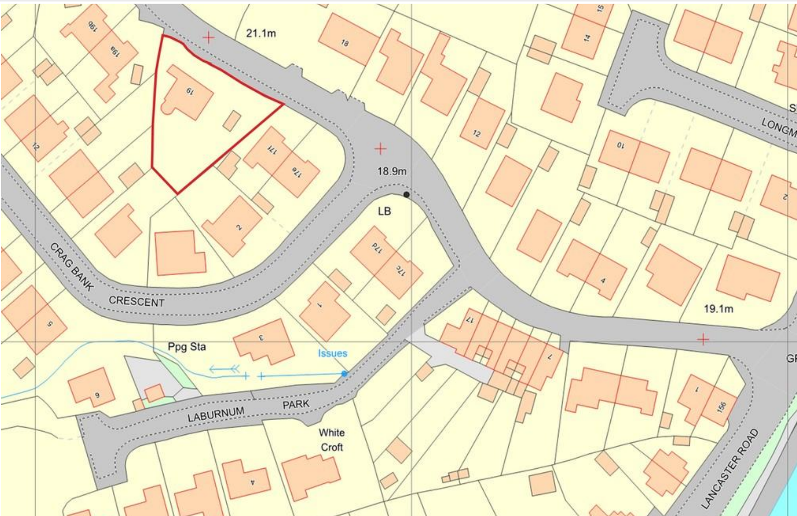
Ordnance Survey 00504986

Request a Viewing Online or Call 01524 737727