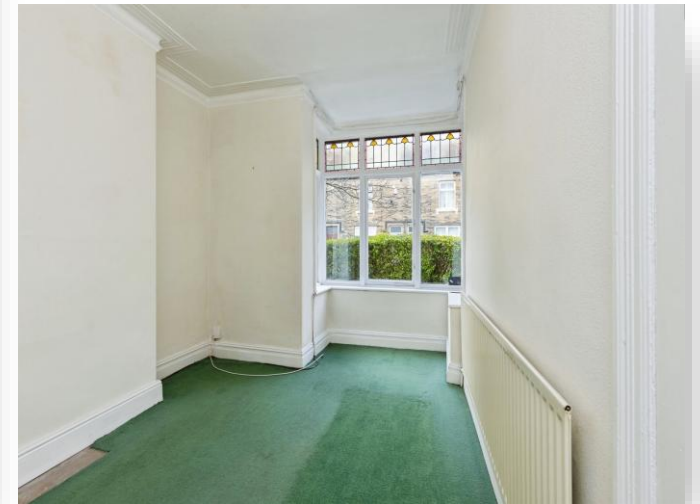
Spring Gardens Road, Bradford BD9 4AD