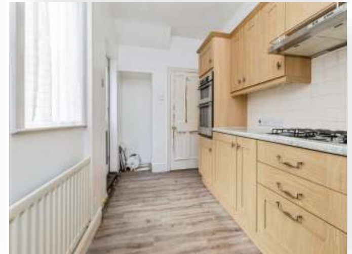
Coleridge Avenue, Hartlepool TS25 5AA