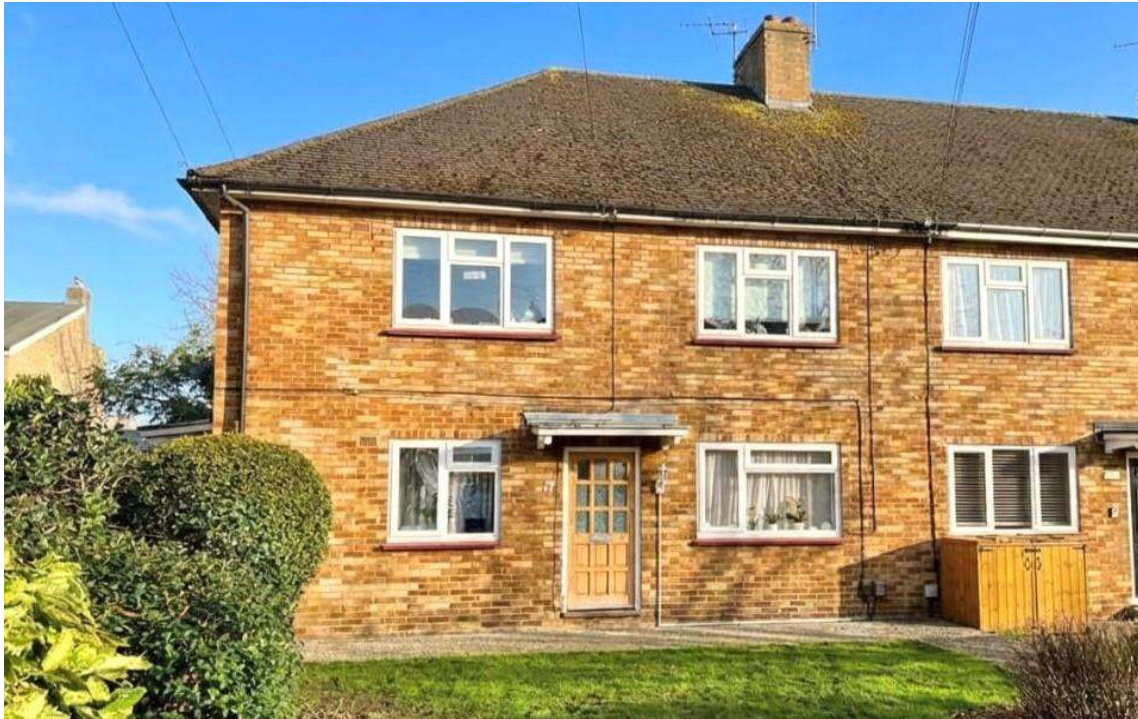
Crown Street, Egham, TW20 9DB