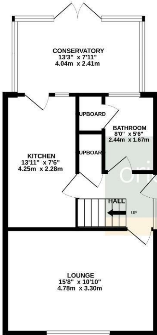
GROUND FLOOR 494 sq.ft. (45.9 sq.m.) approx.