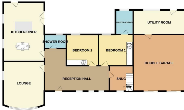
GROUND FLOOR 1734 sq.ft. (161.1 sq.m.) approx.