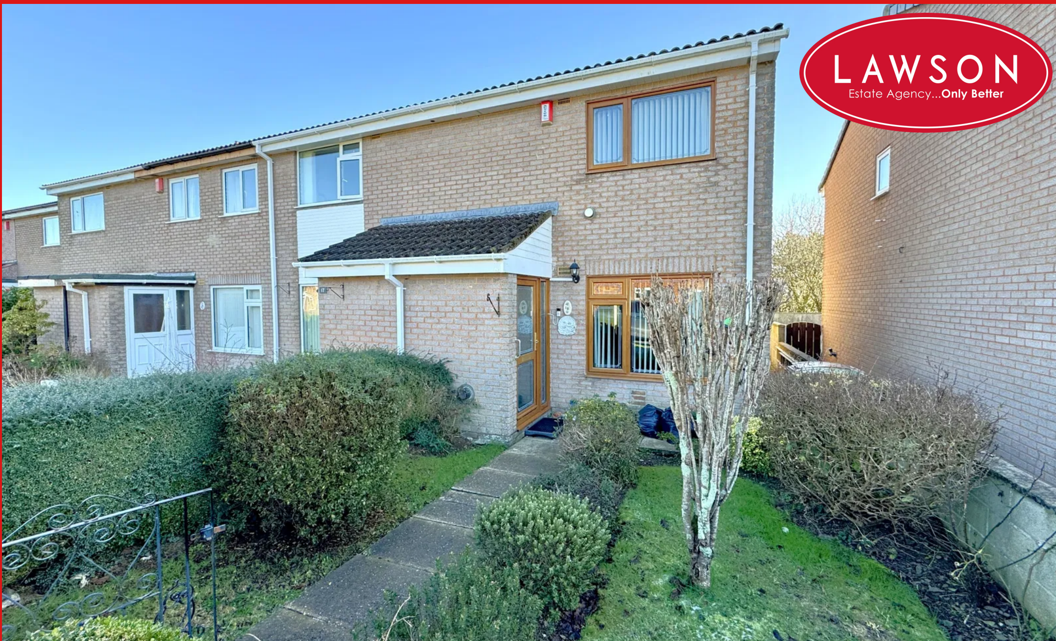
Walcot Close, Thornbury, Plymouth Plymouth