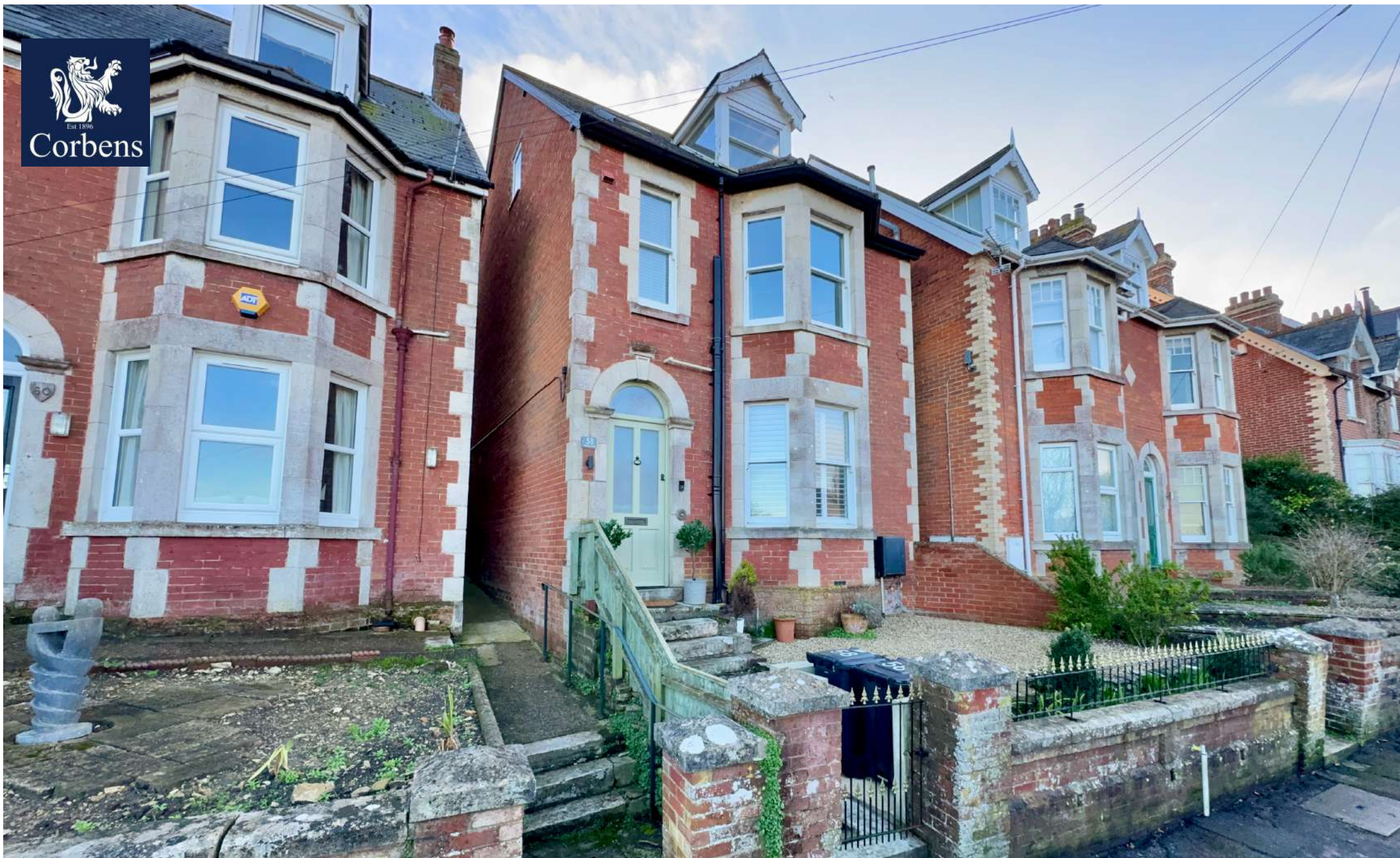
58 QUEENS ROAD, SWANAGE £795,000 Freehold