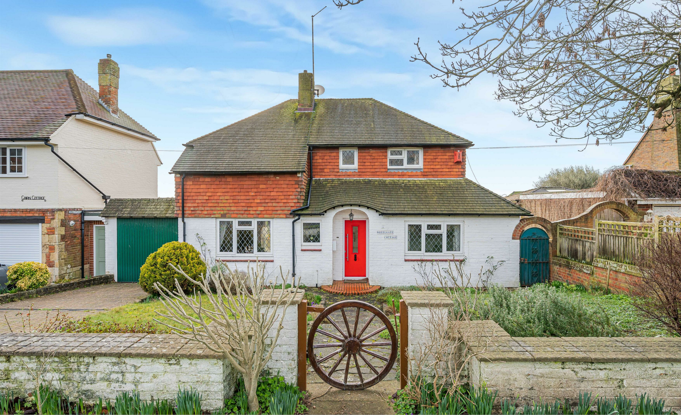
Wheelgate Cottage Homefield Road, Seaford, East Sussex, BN25 3DG