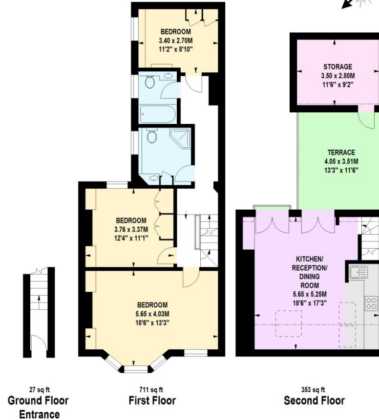
27 sq ft Ground Floor Entrance