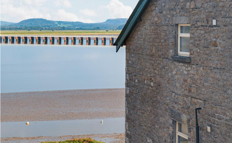
Views from Living Room