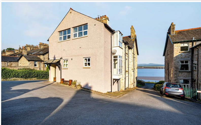
Rear of the Property