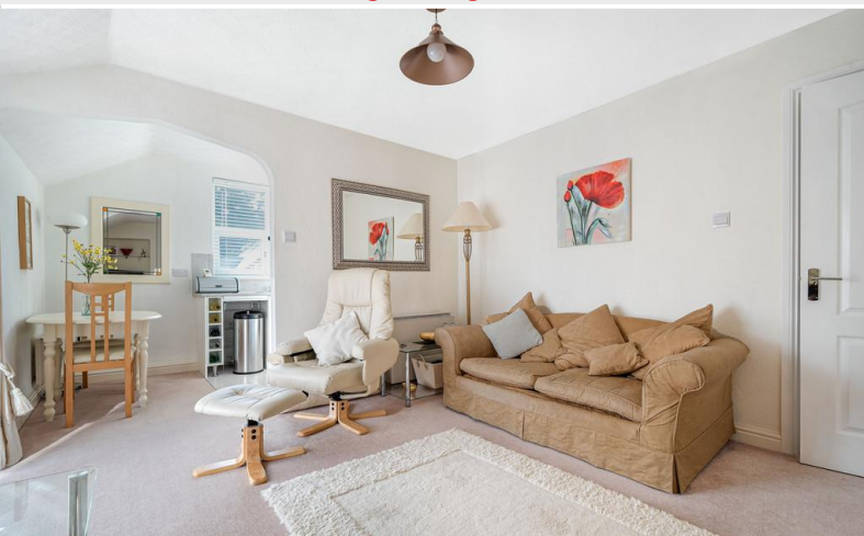
Open Plan Kitchen/Living Area