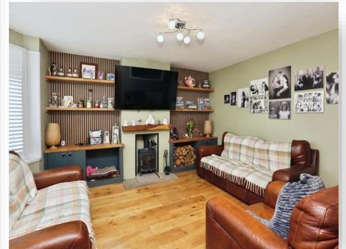
Stoners Close, Gosport, PO13 0SH