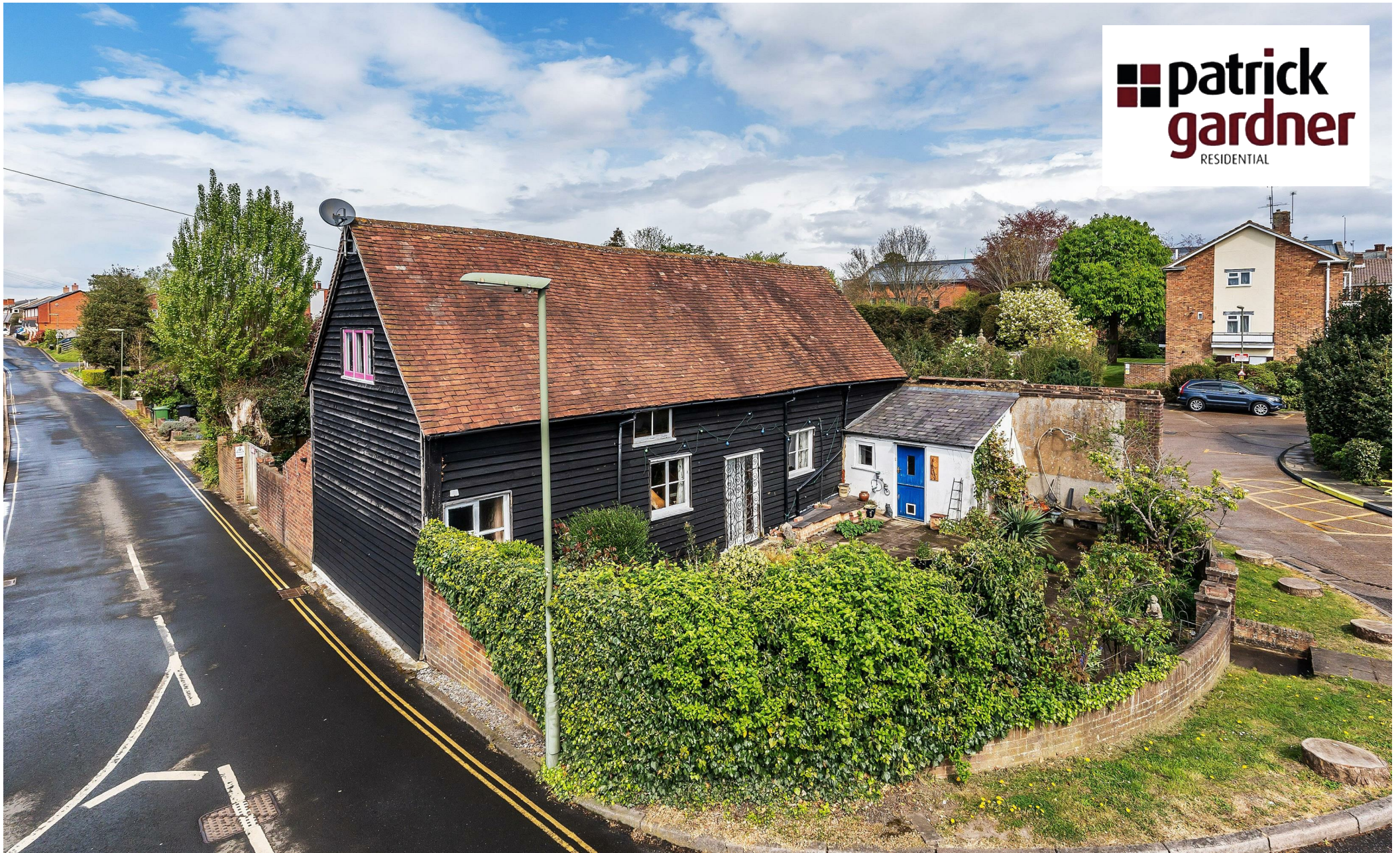
The Barn, Linden Road, Leatherhead, Surrey, KT22 7JF