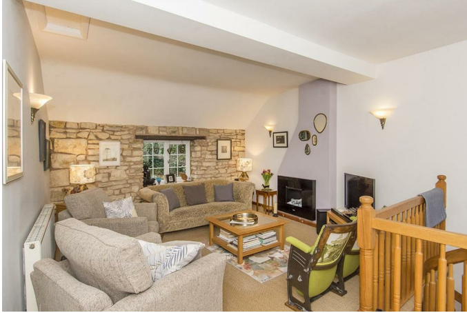
Lounge 19'4" x 13'5" approx (5.89m x 4.09m approx )

UPVC double-glazed window to front with views across the Welland Valley. UPVC double-glazed window to rear. Exposed stone wall. Electric fire with smoke effect. Two radiators.