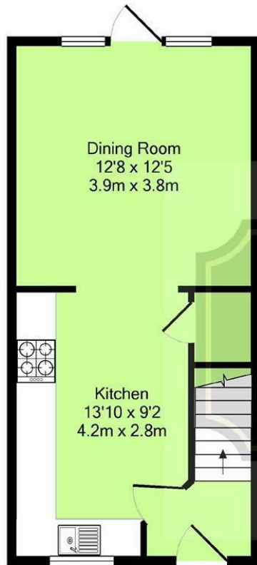
GROUND FLOOR APPROX. FLOOR AREA 329 SQ.FT. (30.6 SQ.M.)