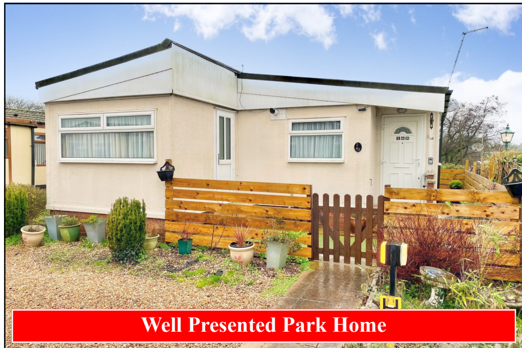
Well Presented Park Home

168 Central Drive, Oaktree Park, St Leonards, Nr Ringwood. BH24 2RN