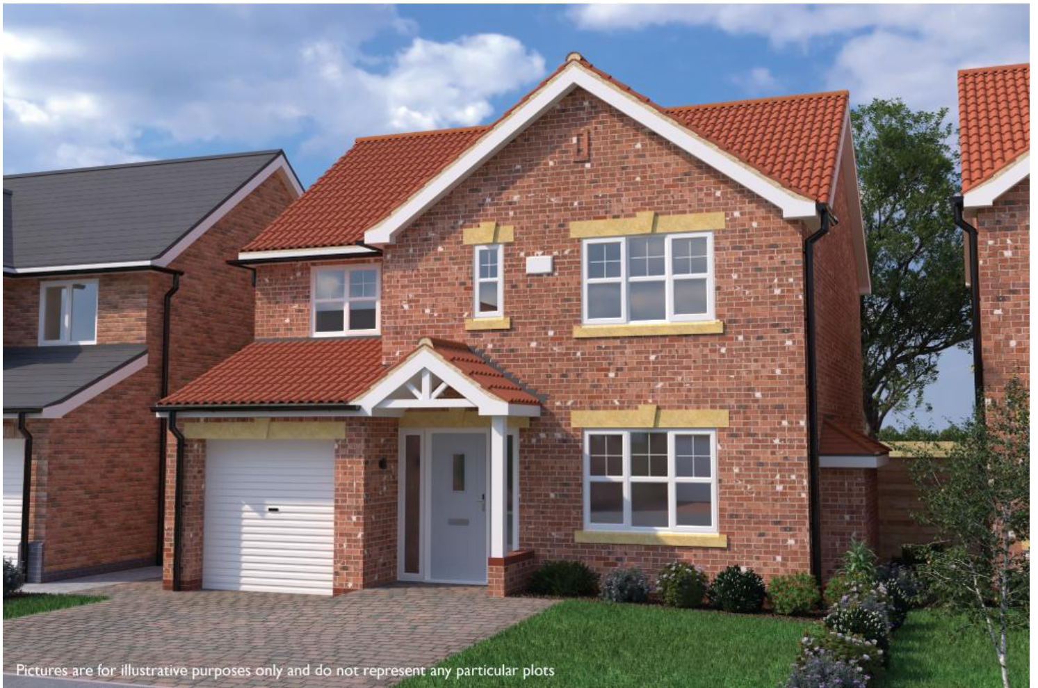
Pictures are for illustrative purposes only and do not represent any particular plots