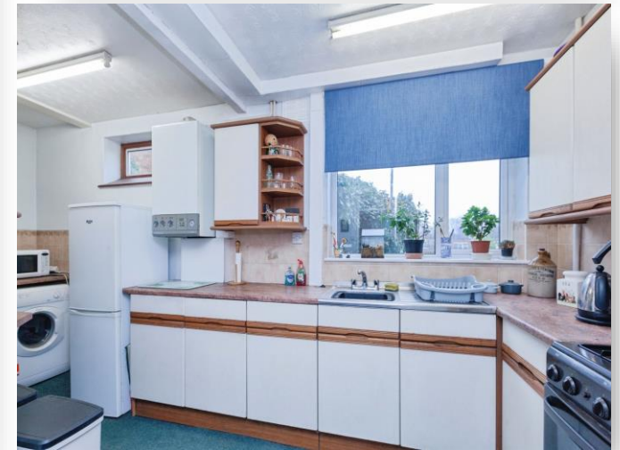
Dudley Avenue, Leicester LE5 2EG