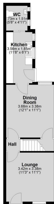
Ground Floor Approx. 37.0 sq. metres (398.7 sq. feet)