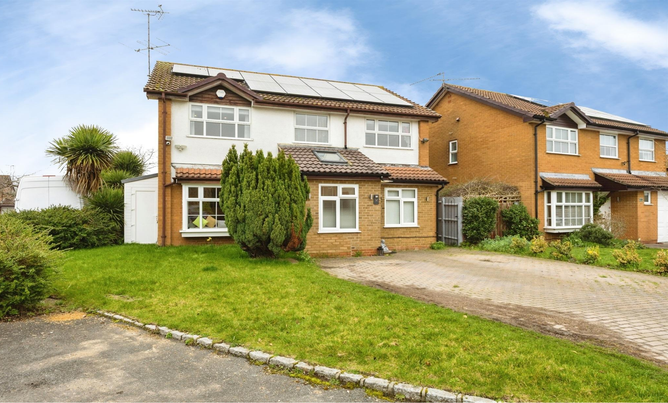
Witcham Close, Lower Earley READING RG6 4HA