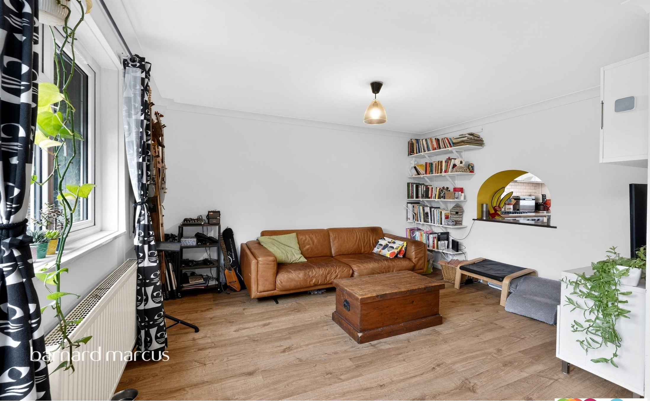
Begbie House St. Martin's Road, London SW9