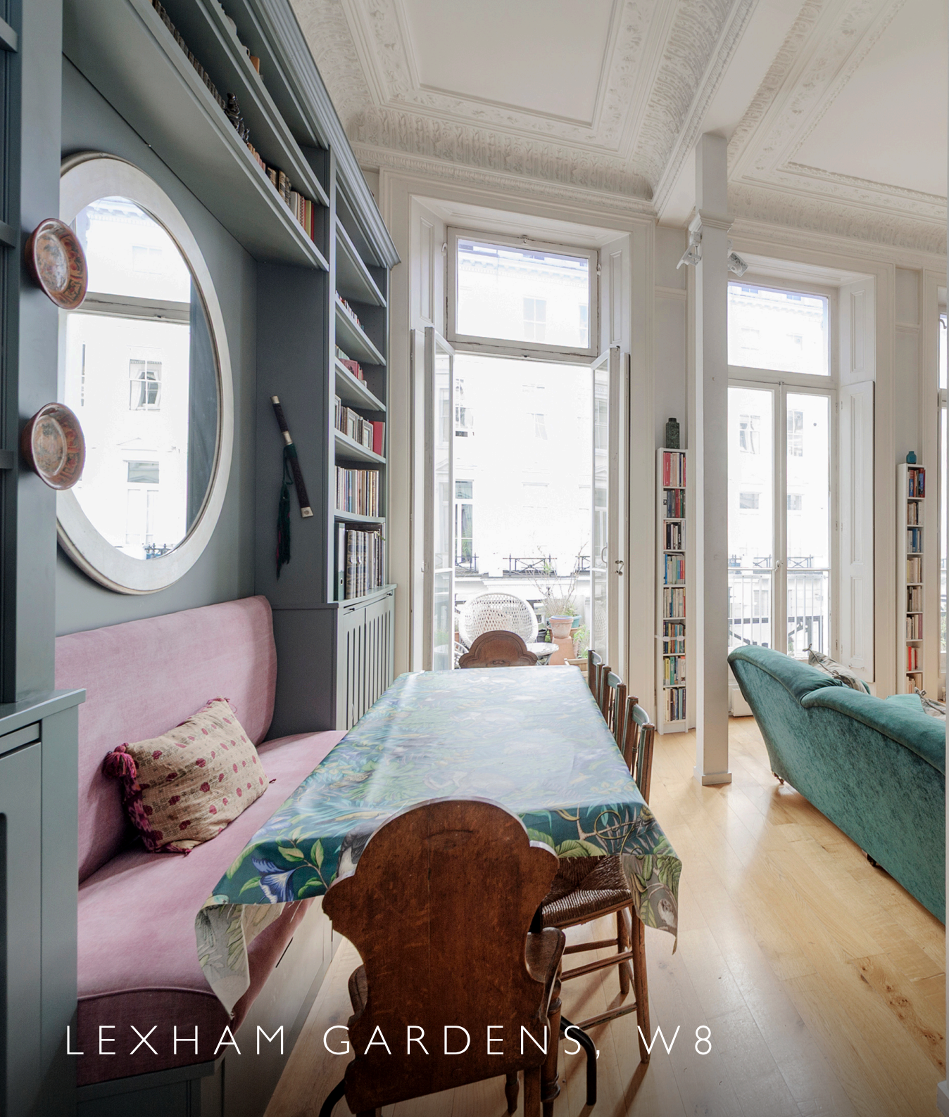
LEXHAM GARDENS, W8