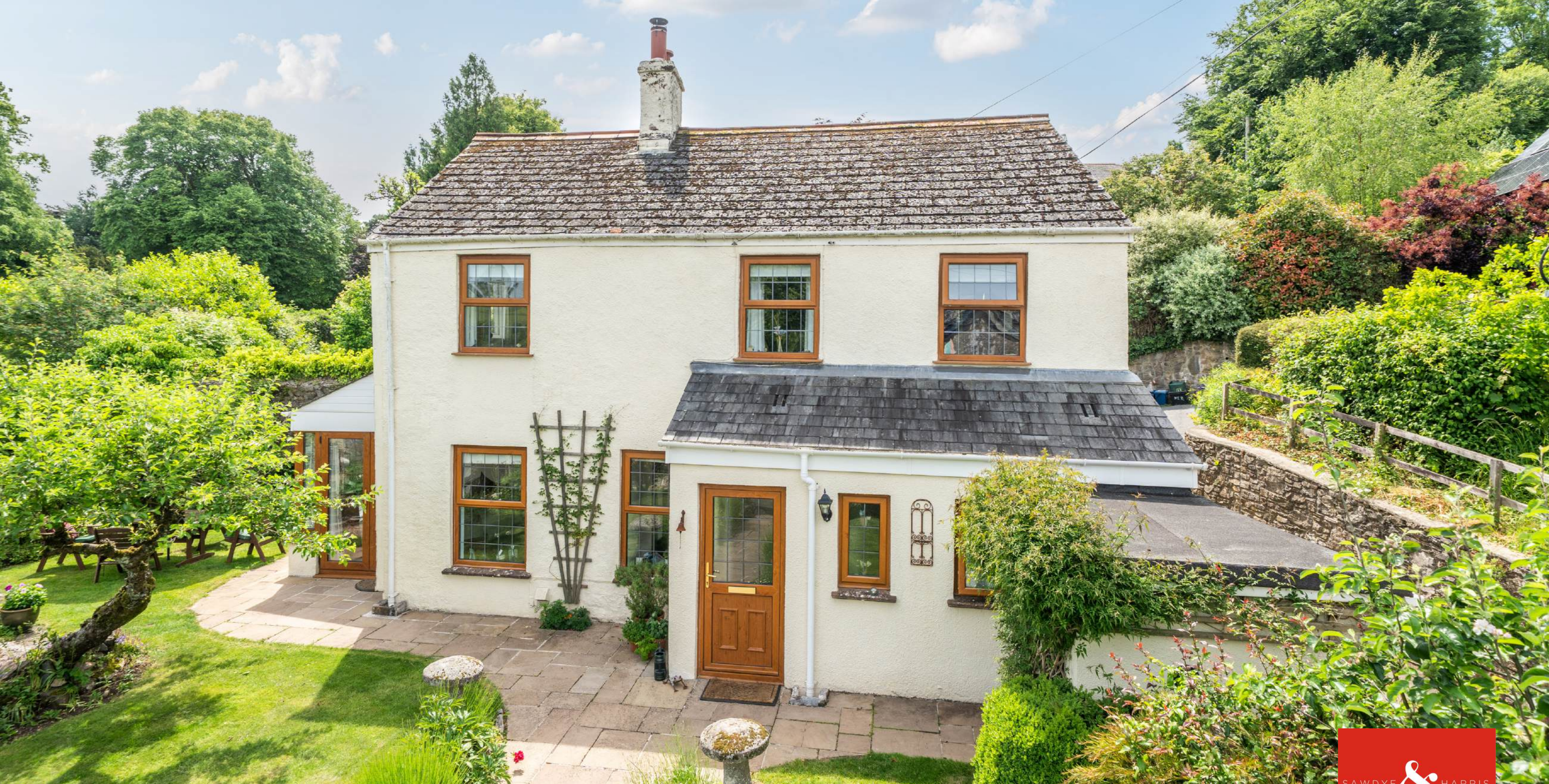
FELSTEAD, 5 BOWDEN HILL, ASHBURTON, TQ13 7EA