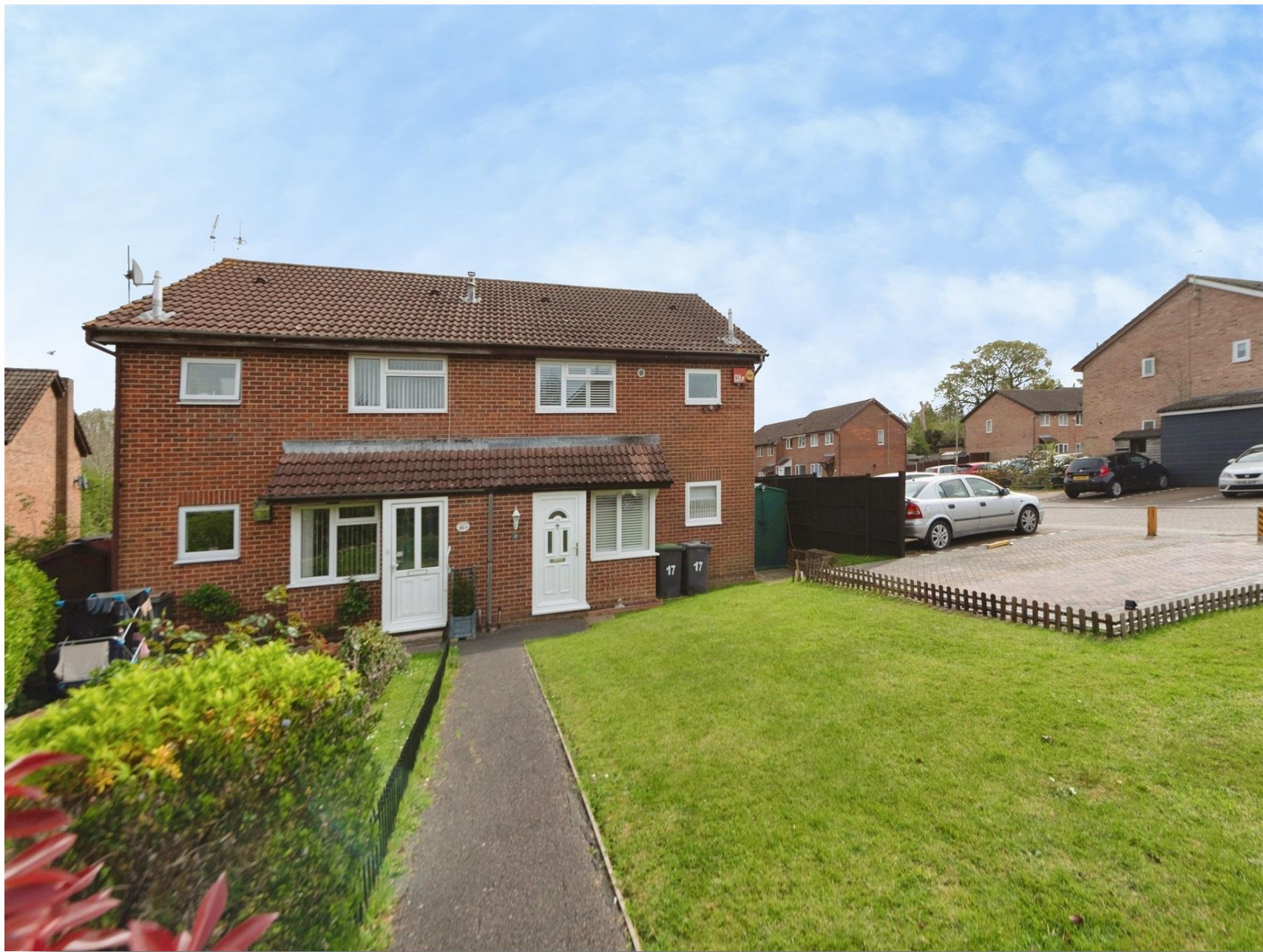
Starina Gardens, Waterlooville PO7 8QT