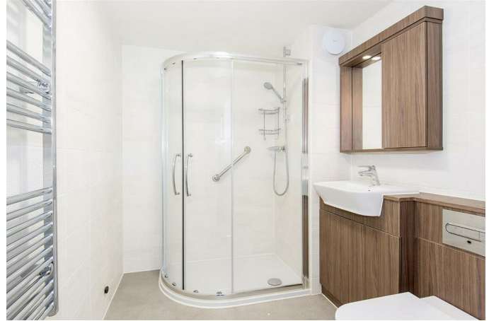
Shower Room 7'4" x 6'2" (2.24m x 1.88m)

W/C. Wash hand basin over storage unit. Shower cubicle. Extractor fan. Tiled walls. Heated towel rail.