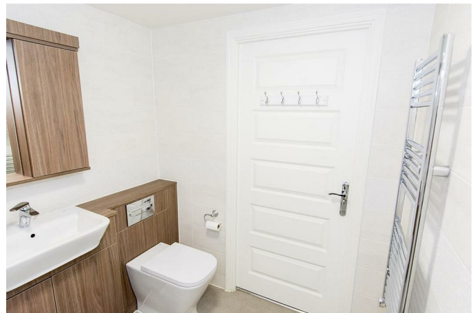
(Shower Room Photo Two)

W/C. Wash hand basin over storage unit. Shower cubicle. Extractor fan. Tiled walls. Heated towel rail.