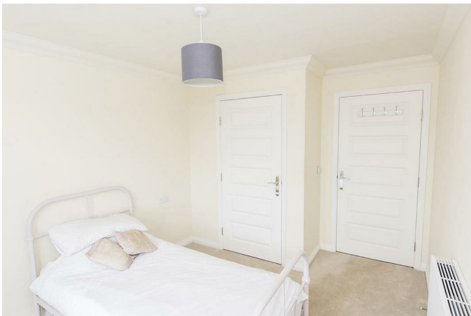
(Bedroom Photo Two)