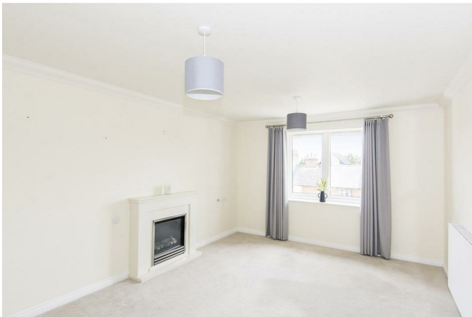
Lounge 15'9" x 11'3" (4.80m x 3.43m)

UPVC double-glazed window. Electric radiator. Coved ceiling.