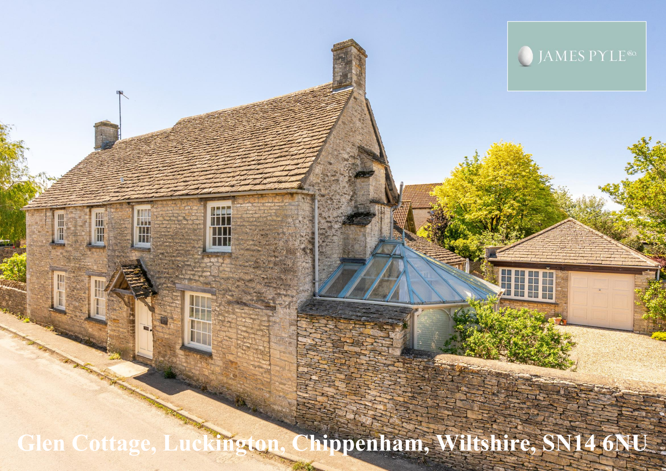
Glen Cottage, Luckington, Chippenham, Wiltshire, SN14 6NU