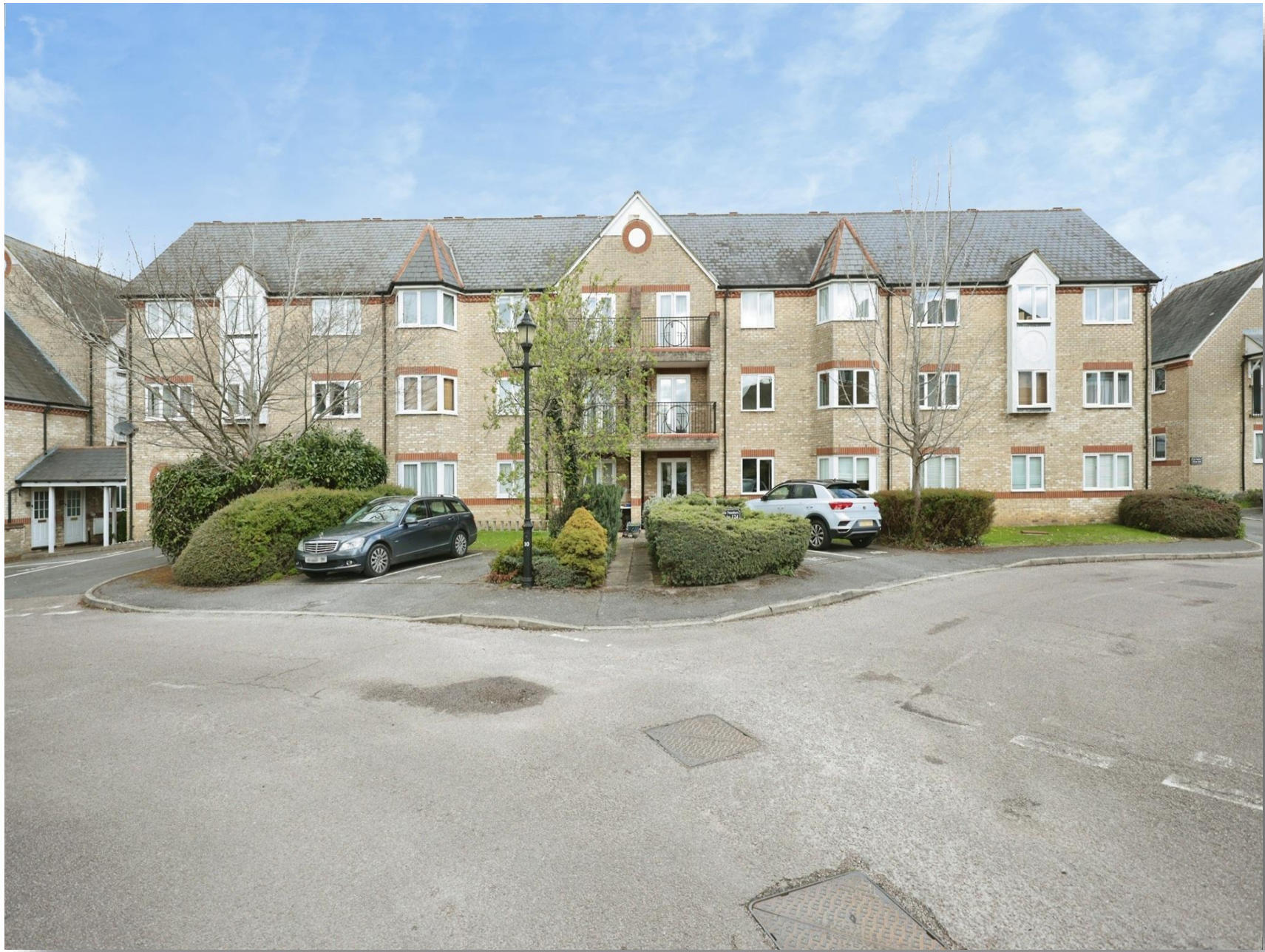
Norbury Avenue, Watford, WD24 4PD