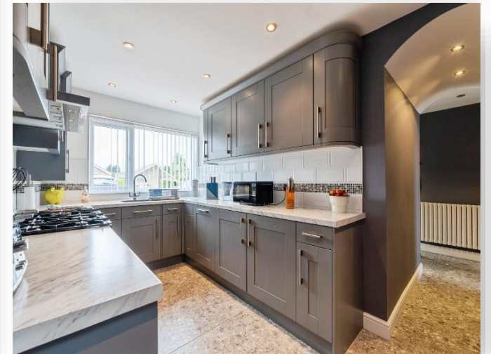
Heather Way, Brandon, IP27 0SZ