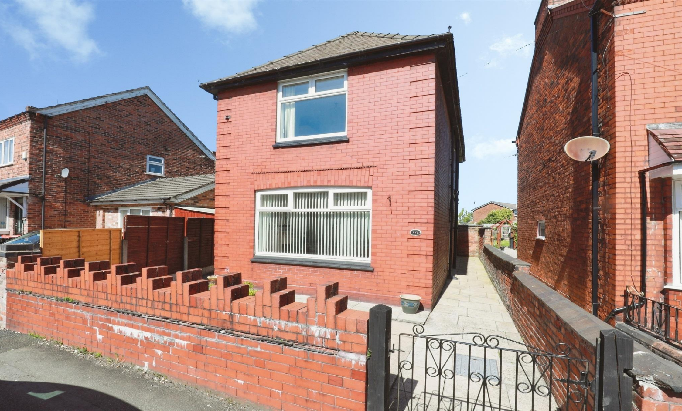
Lydyett Lane, Barnton NORTHWICH CW8 4JS