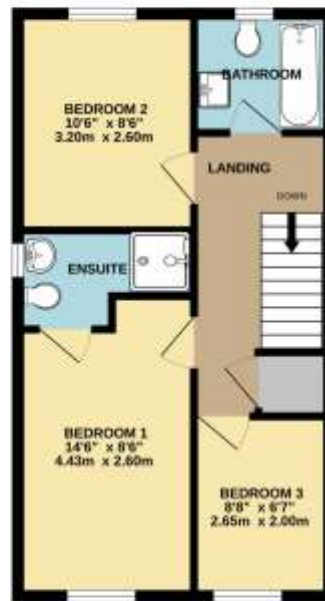
TOTAL FLOOR AREA - 827 sq.ft. (76.8 sq.m.) approx.

While every attempt has been made to ensure the accuracy of the floorplan, a professional surveyor's report is advised. The floor plan is for illustrative purposes only and should not be used as a substitute for a professional survey. The accuracy of the floorplan is not guaranteed. All measurements are approximate. © Starkey & Brown 2020