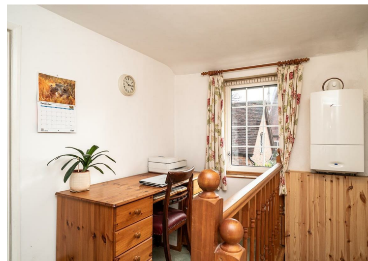
1, Bell Lane Northchurch