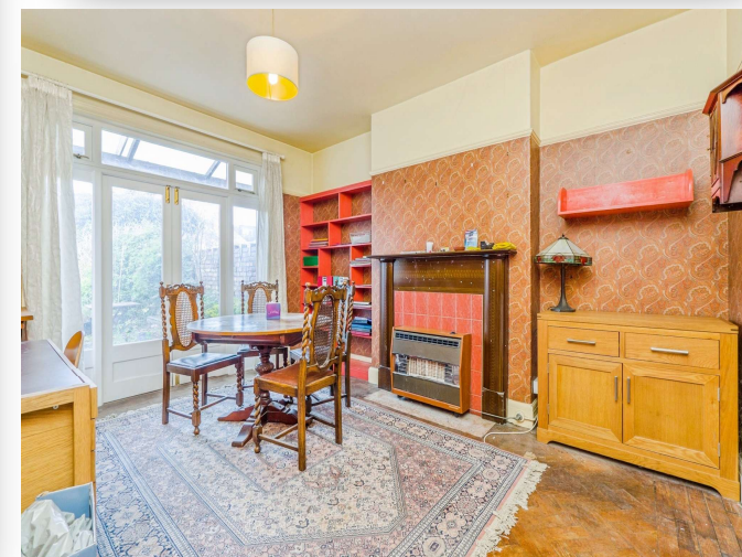
Princes Street, Roath Cardiff CF24 3SL