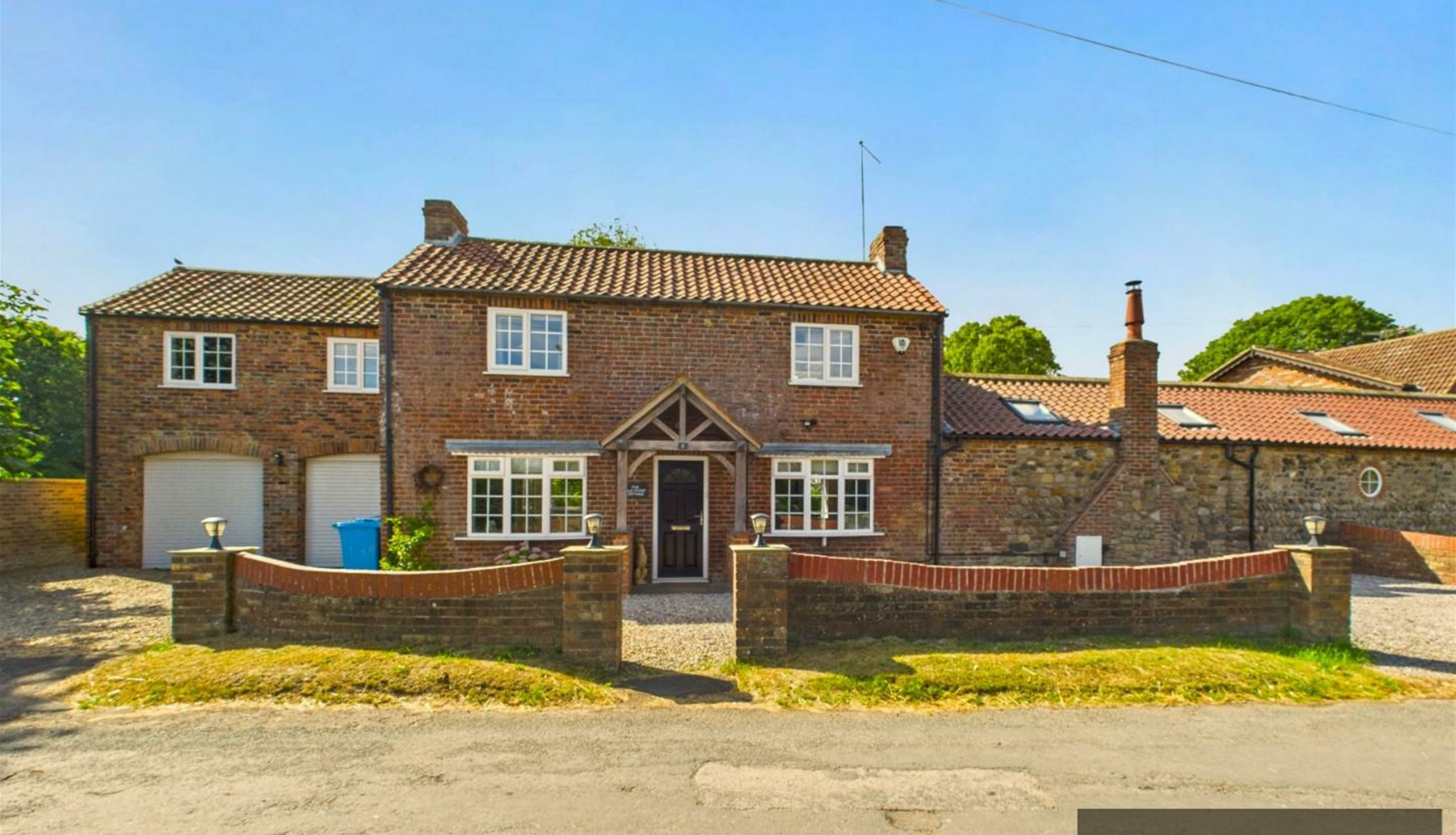
The Old Pump Cottage, Fraisthorpe, YO15 3QT