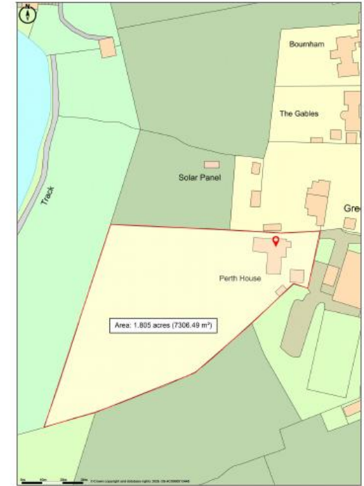
Promap OS AC0000813445 Plotted Scale - 1:1250. Paper Size - A4