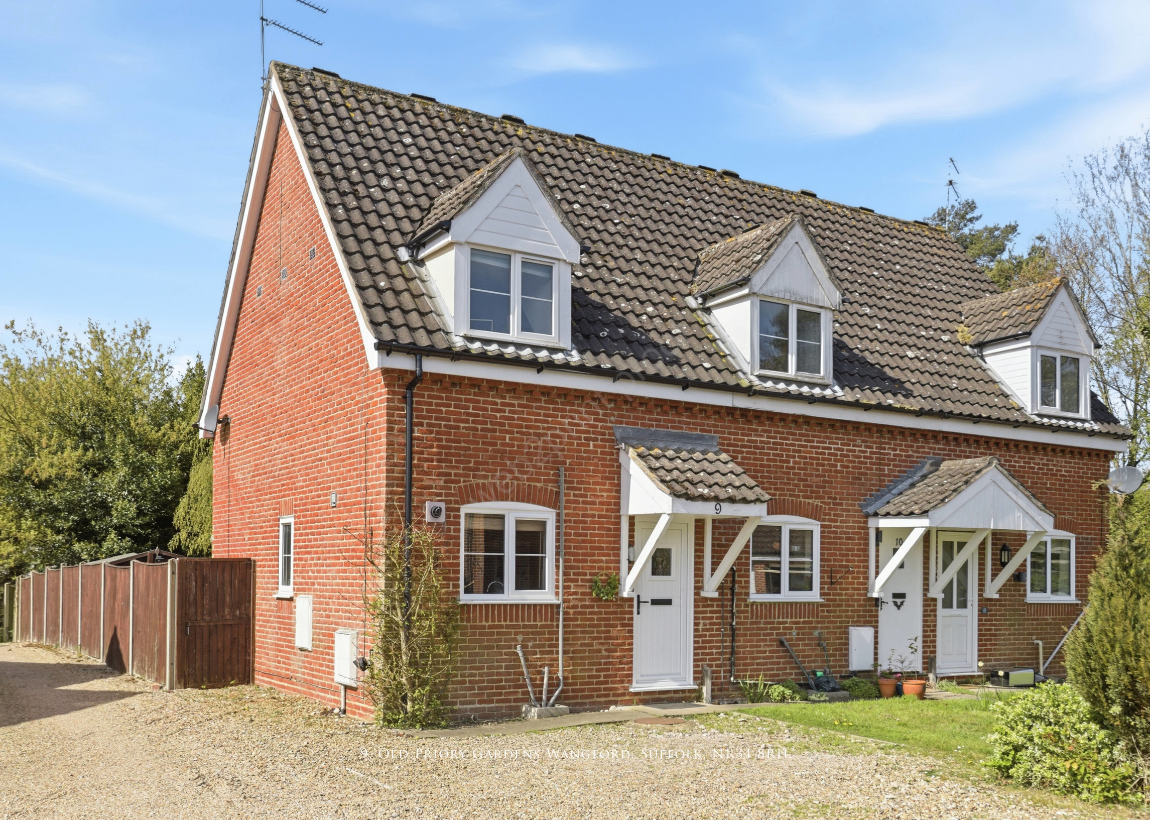
9, OLD FRIORY GARDENS WANGFORD, SUFFOLK, NR34 8RH